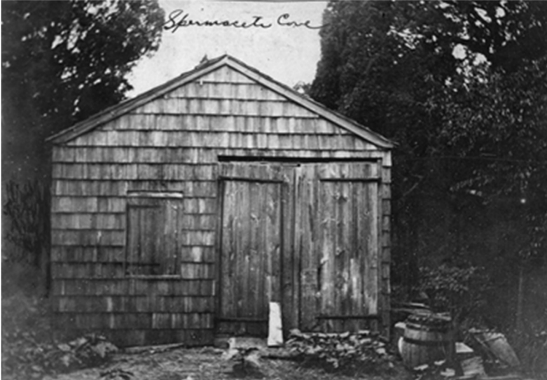
Earliest known photo of the 1849 station, circa 1900.

One of the most unusual pieces of equipment, commissioned for this project, was the new corrugated iron surfboat designed to be pulled from shore to ship and back suspended by a heavy rope known as a hawser.