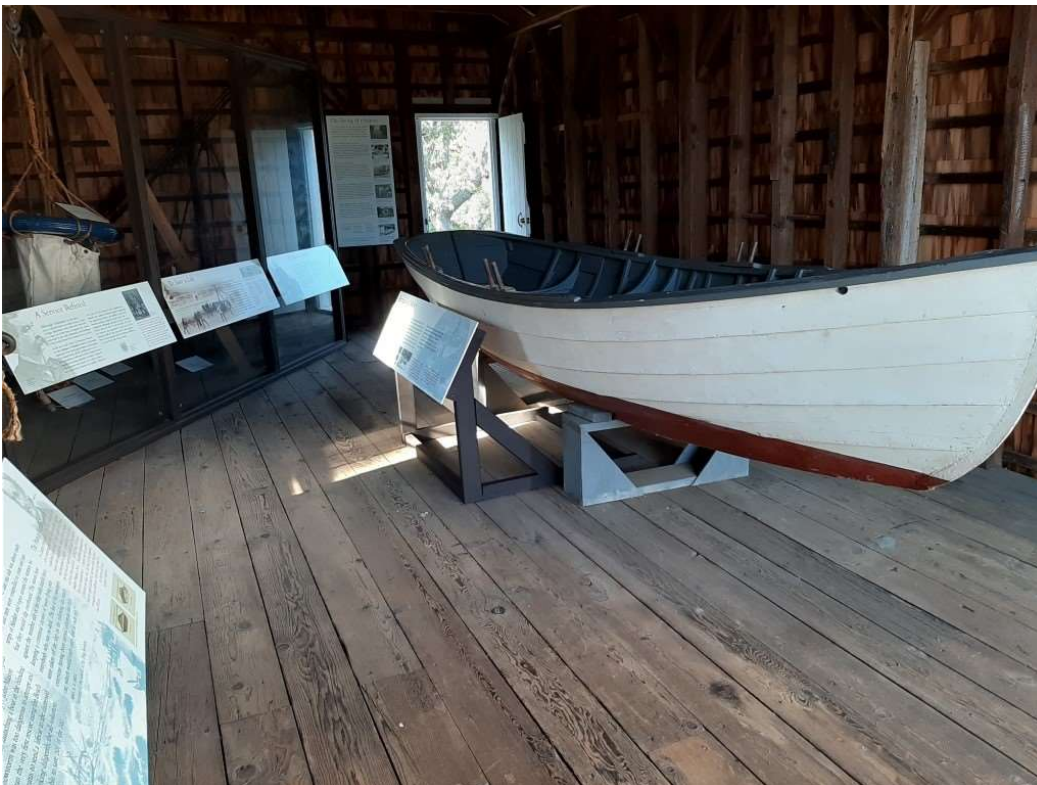
Staff Photo, October 19, 2019.

The new volunteer service was not universally successful and a pair of disastrous wrecks in 1854 cost the lives of nearly 400 passengers and crew within site of the volunteers on shore who were unable to assist them. These tragedies and a track record of poorly kept stations eventually lead to the adoption of professionally trained crews and the formation of the United States Lifesaving Service in 1878. This legacy of lifesaving work is continued today by the United States Coast Guard, which was formed in 1915 from the U.S.L.S.S. and the Revenue Marine.